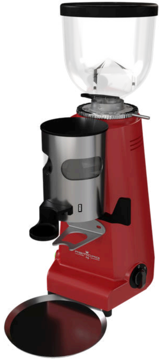
MST-64PM Manual with Auto-Stop

MST PROFESSIONAL GRINDERS BY REMIDAG ARE SUPER-FAST GRINDERS, EQUIPPED WITH A FULL TOUCHSCREEN FOR AND EASY PROGRAMMATION, ROBUST BODY AND STRONG MOTOR.