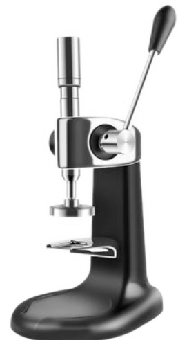
Dynamometric coffee press