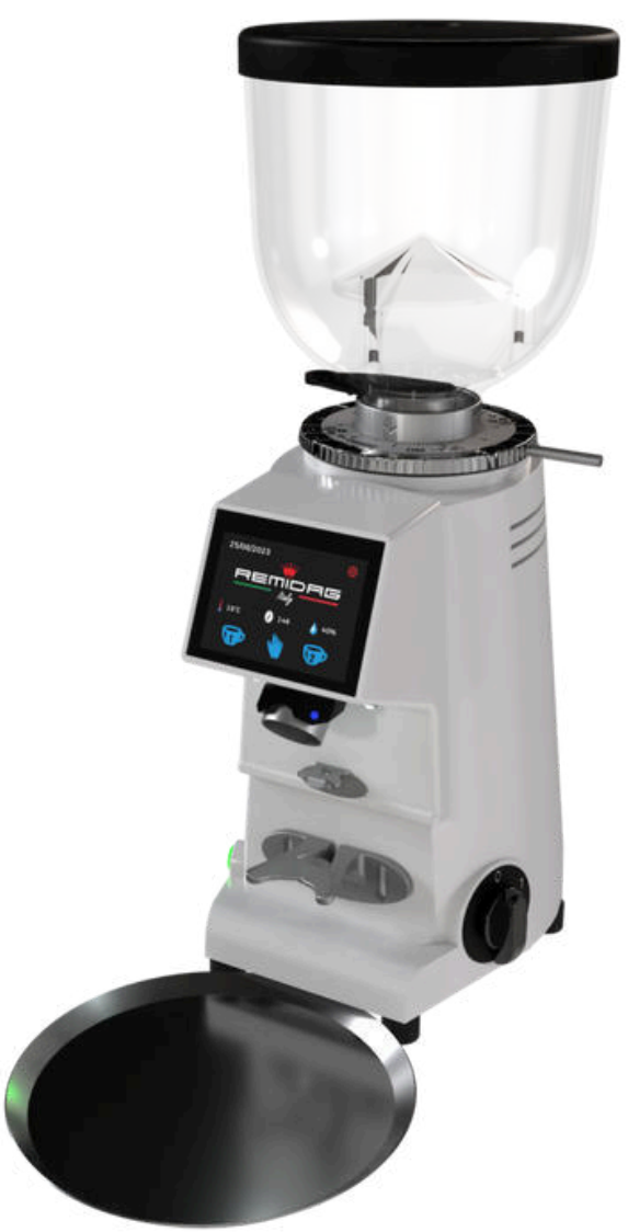
MST-64PE Electronic On-Demand