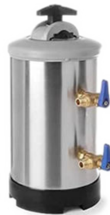
Salt softener (8L and 12L)