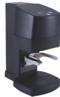
Automatic coffee press