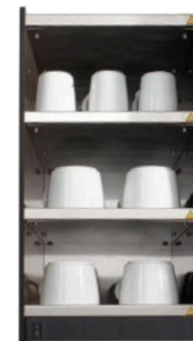
Professional cup warmer