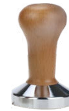
Manual coffee press