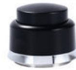
Elastic coffee press